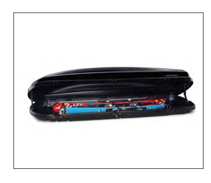
Roof box Comfort, 460 litres, high-gloss black