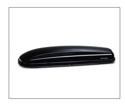
Roof box Comfort, 340 litres, high-gloss black