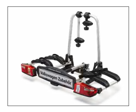
Bicycle carrier for the towing hitch 2 bicycles, folding, Compact III