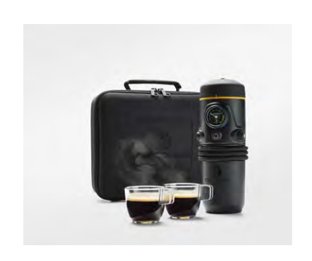
Espresso maker 12V on-board power operation