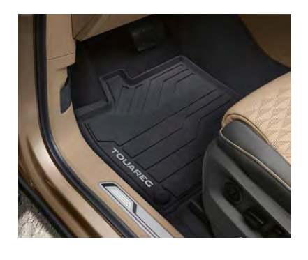
All-weather floor mat set Front + rear