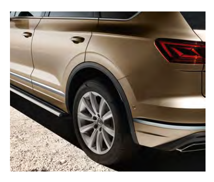
Footboard for the side skirt Aluminium, silver, anodised