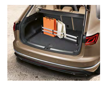
Cargo liner Luggage compartment plug-in module