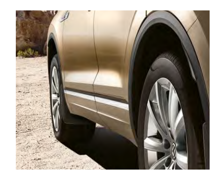
Mud flap Front