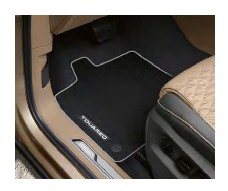
Textile footmats Premium