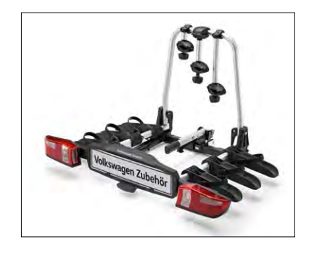
Bicycle carrier for the towing hitch 3 bicycles, folding, Compact III