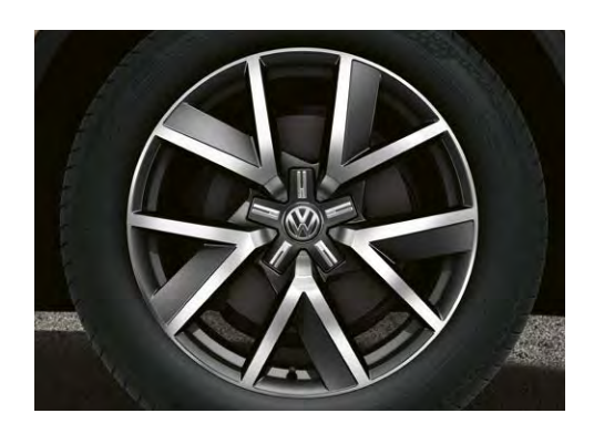
"Braga" 20" Alloy (Standard on Executive)