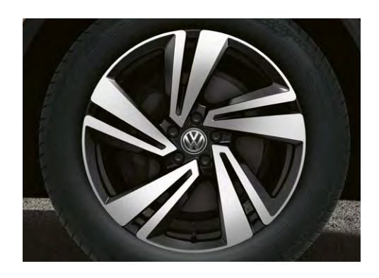
"Nevada" 20" Alloy (Optional on the Luxury model when the R-Line Package is selected)