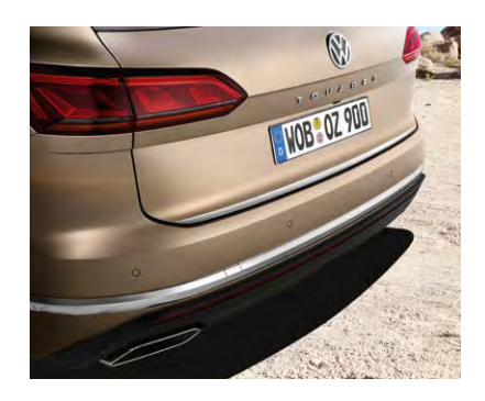
Loading lip protection Transparent