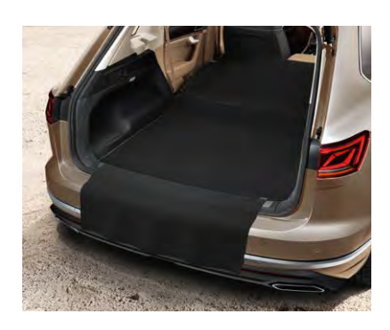
Boot mat - reversible Velour/plastic nubs