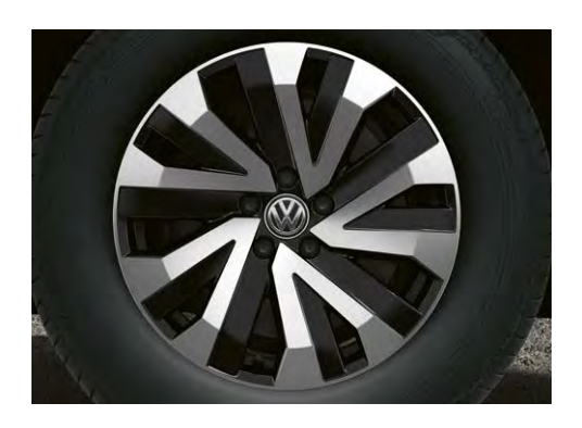
"Concordia" 18" Alloy (Optional on Luxury)