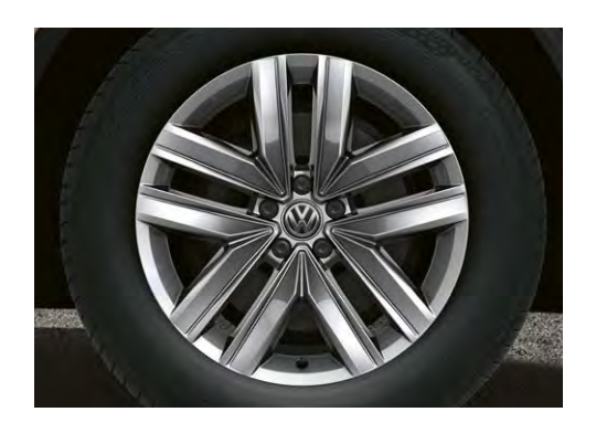
"Esperance" 19" Alloy (Standard on Luxury)