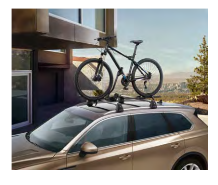
Bicycle holder* For bicycle frames of up to 100 mm (oval)/80 mm (round)