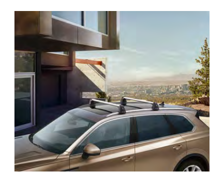
Supporting rods T-groove, Aero profile