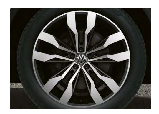
"Suzuka" 21" Alloy (Optional on Executive)