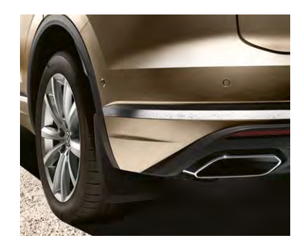
Mud flap Rear

The new Touareg has arrived and is the most technologically and visually progressive SUV from Volkswagen to date. It's a luxury vehicle that offers you accessories that enable you to have your personal taste and style reflected, inside and out, and caters to meet your practical needs as well.