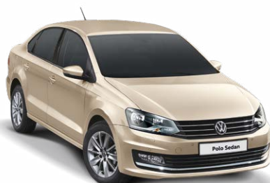
Titanium Beige Metallic ONON