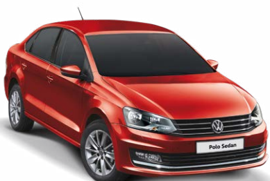
Flash Red Non-metallic D8D8