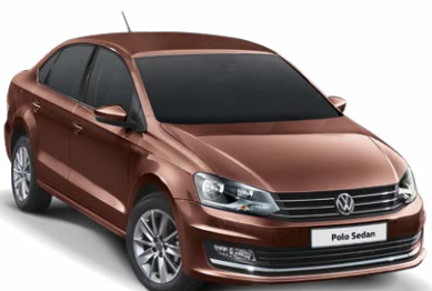
Toffee Brown Metallic 4Q4Q