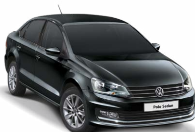
Carbon Steel Grey Metallic 1k1k