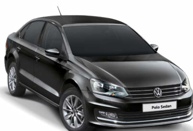
Deep Black Pearl Effect 2T2T