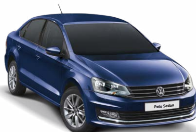
Blue Silk Metallic 2B2B