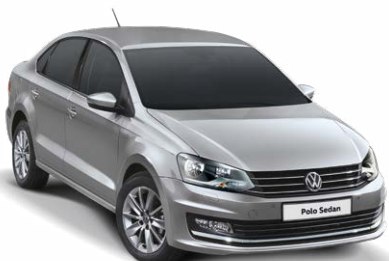
Reflex Silver Metallic 8E8E