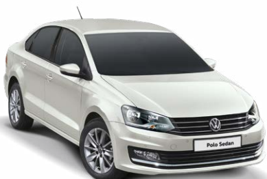
Candy White Non-metallic B4B4