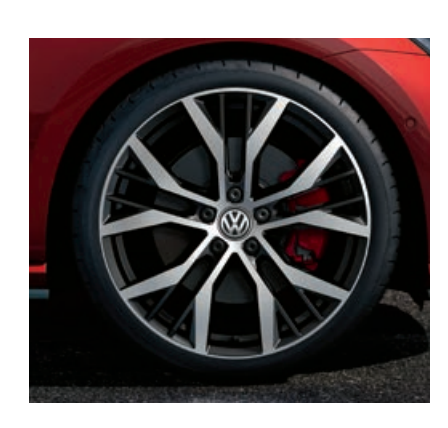
19" "Santiago" Alloy (Optional on GTI)