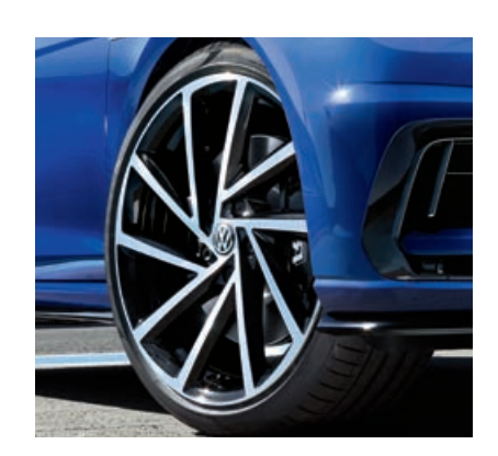
19" "Spielberg" Alloy (Standard on R)