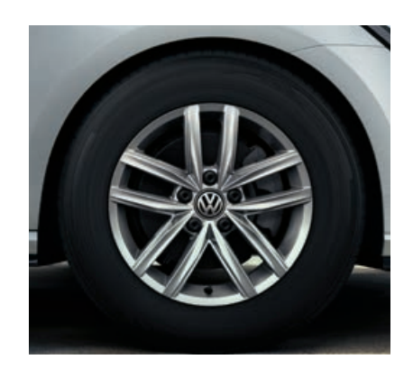
16" "Hita" Alloy (Standard on Comfortline)