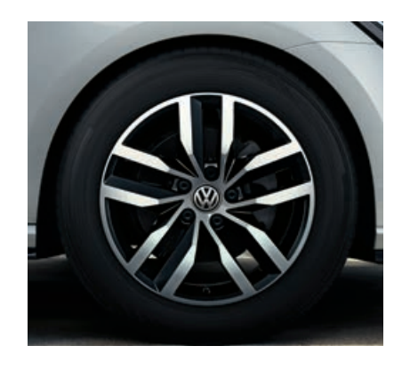
17" "Madrid" Alloy (With R-line Exterior)