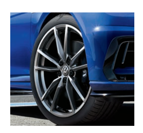
19" "Pretoria" Alloy (Optional on R)