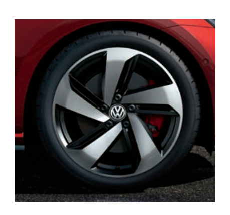
18" "Milton Keynes" Alloy (Standard on GTI)