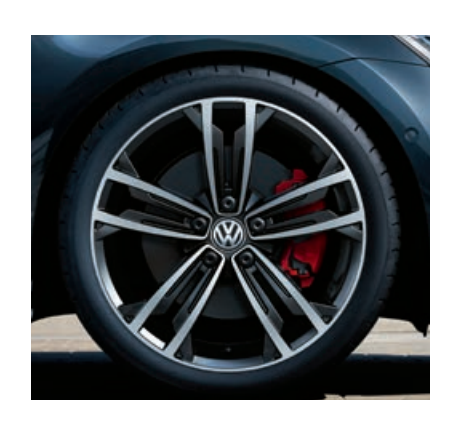
18" "Sevilla" Alloy (Standard on GTD)