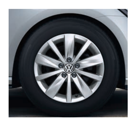
15" "Lyon" Alloy (Standard on Trendline)