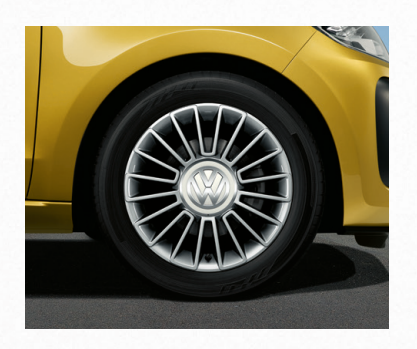
15" Spoke Alloy 185/55 R15 Optional: Move up!