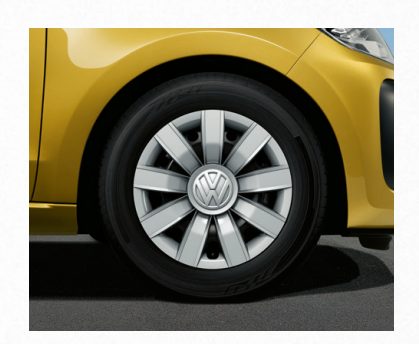
14" Steel 165/70 R14 Standard: Take up!

Whether you prefer a full trim or Spoke-styled alloy wheel, each one of our 14", 15" and 16" wheel designs have been created exclusively for the up! adding a real touch of contemporary style.