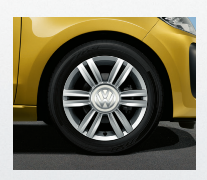
15" Radial Alloy 185/55 R15 Standard: up! beats