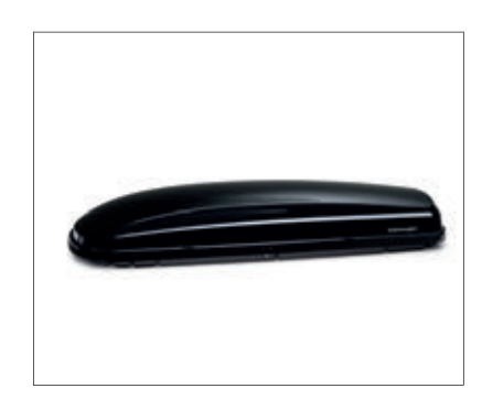
Roof box Comfort, 340 litres, high-gloss black