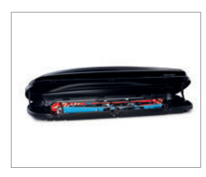
Roof box Comfort, 460 litres, high-gloss black