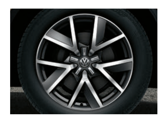
"Braga" 20" Alloy (Standard on Executive)