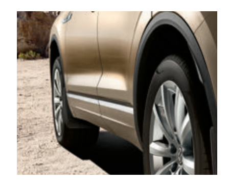
Mud flap Front