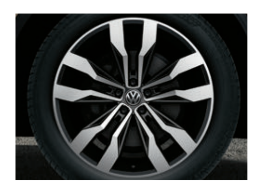
"Suzuka" 21" Alloy (Optional on Executive)