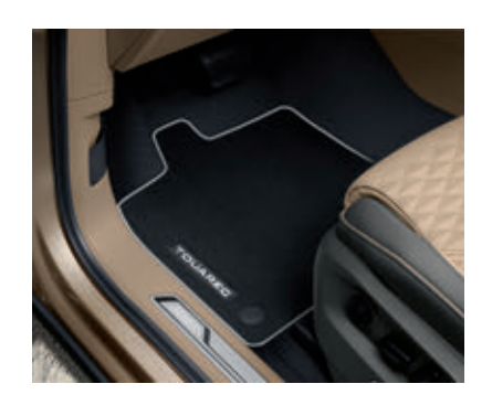
Textile footmats Premium