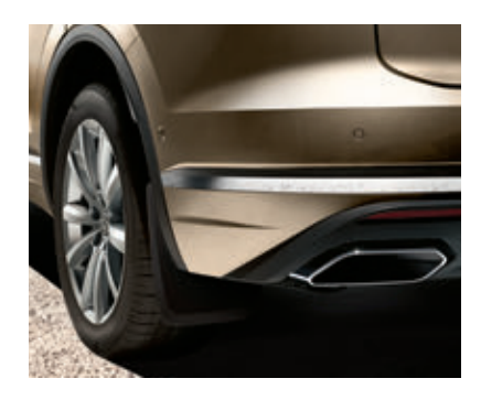
Mud flap Rear

The Touareg has arrived and is the most technologically and visually progressive SUV from Volkswagen to date. It's a luxury vehicle that offers you accessories that enable you to have your personal taste and style reflected, inside and out, and caters to meet your practical needs as well.