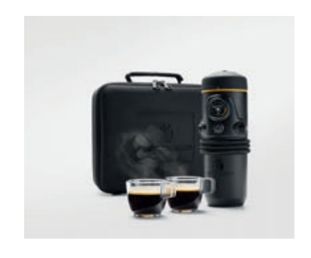
Espresso maker 12V on-board power operation