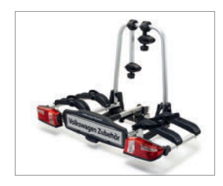
Bicycle carrier for the towing hitch 2 bicycles, folding, Compact III