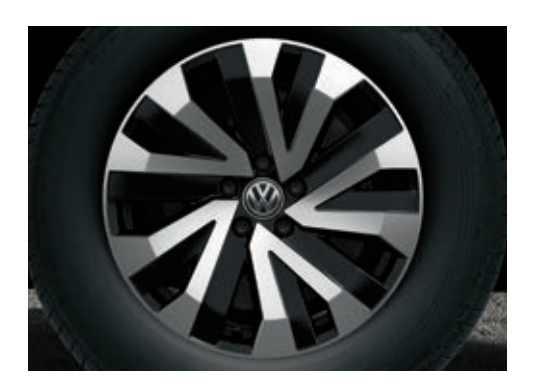
"Concordia" 18" Alloy (Optional on Luxury)