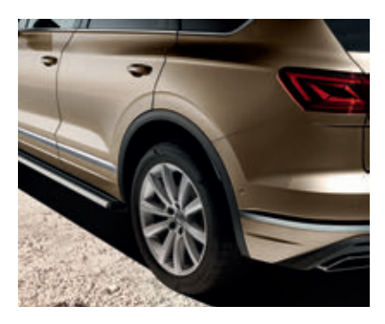
Footboard for the side skirt Aluminium, silver, anodised