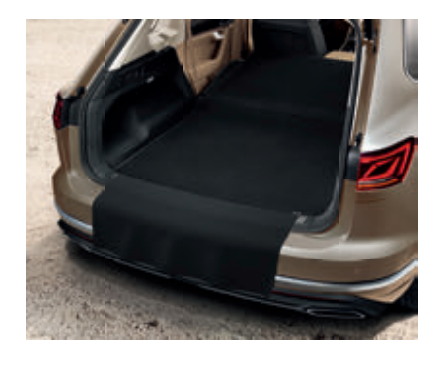
Boot mat - reversible Velour/plastic nubs