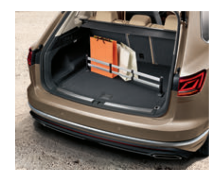
Cargo liner Luggage compartment plug-in module