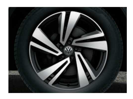
"Nevada" 20" Alloy (Optional on the Luxury model when the R-Line Package is selected)