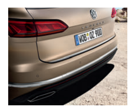
Loading lip protection Transparent