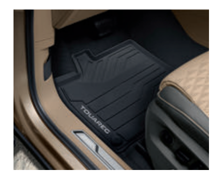
All-weather floormat set Front + rear