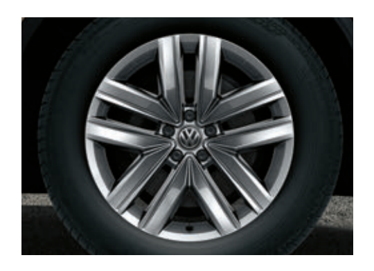
"Esperance" 19" Alloy (Standard on Luxury)