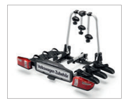
Bicycle carrier for the towing hitch 3 bicycles, folding, Compact III