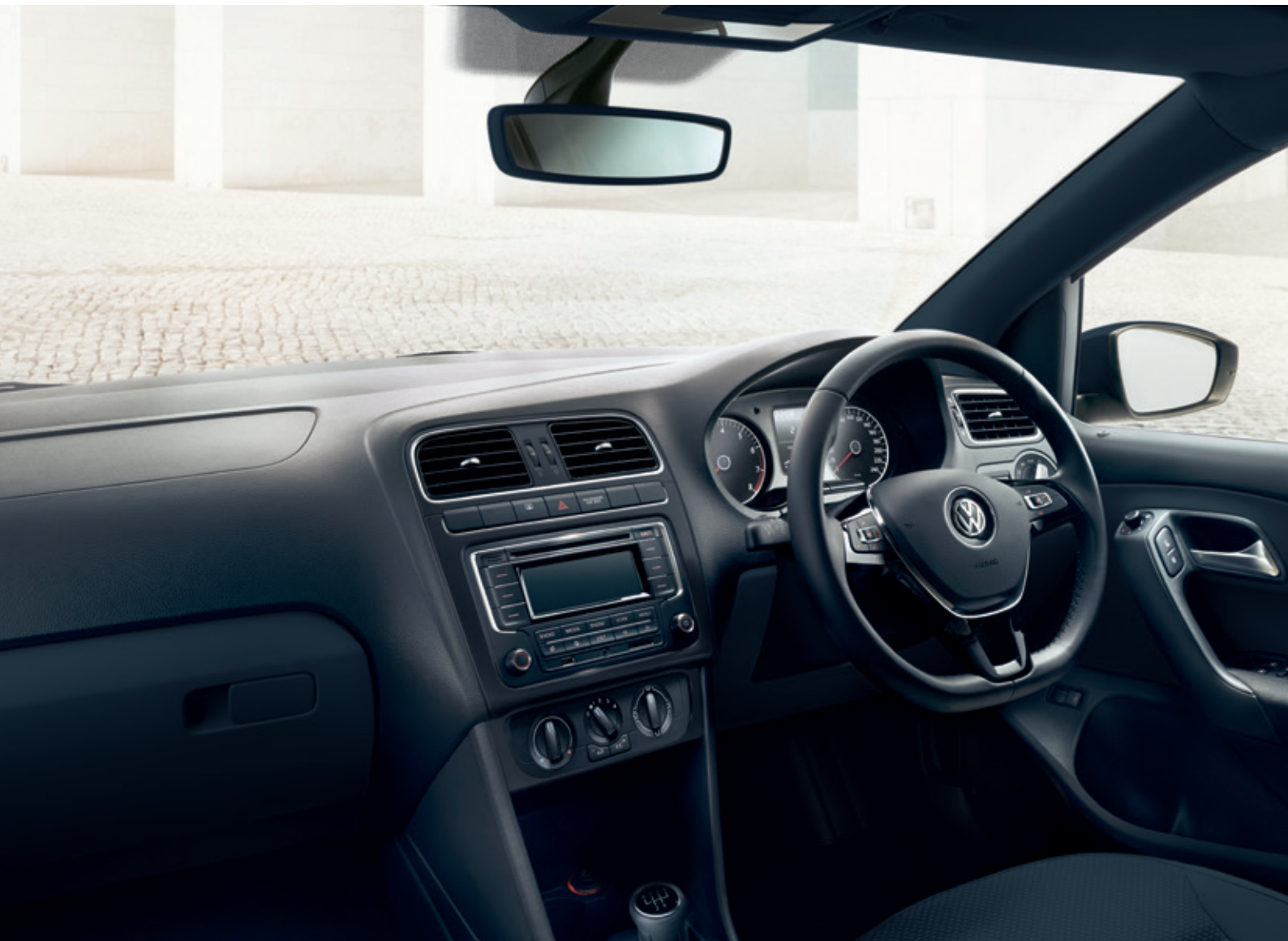
Image does not depict the new RCD-R340G radio (standard on Comfortline)