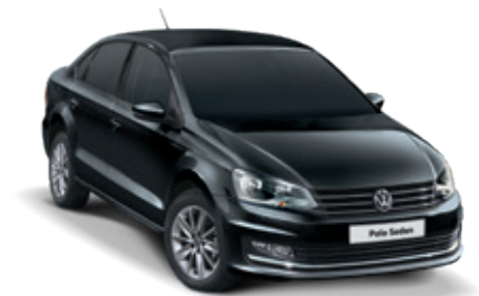
Carbon Steel Grey Metallic 1k1k