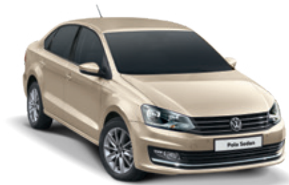
Titanium Beige Metallic ON0N