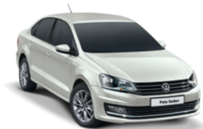
Candy White Non-metallic B4B4