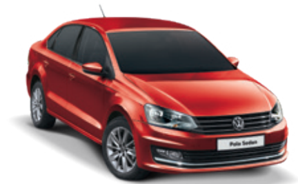
Flash Red Non-metallic D8D8