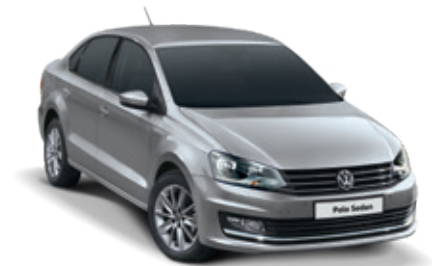
Reflex Silver Metallic 8E8E