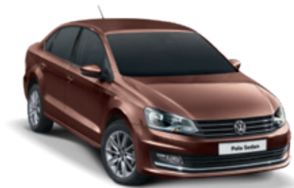
Toffee Brown Metallic 4Q4Q