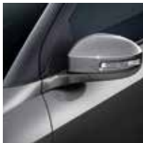
Silky Silver Metallic

With an array of eye-catching colours to choose from, it will be easy to find your perfect Swift 1.2 Hatch to match your personality and your life.