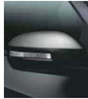
Glistening Grey Metallic