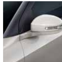
Artic White Pearl