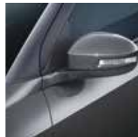
Glistening Grey Metallic