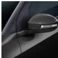
Midnight Black Pearl