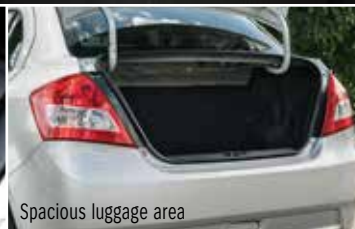
Spacious luggage area