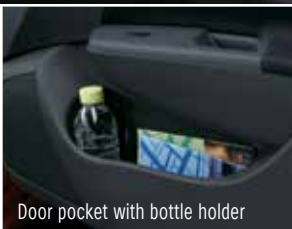
Door pocket with bottle holder