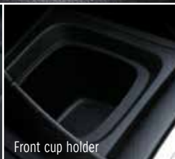
Front cup holder