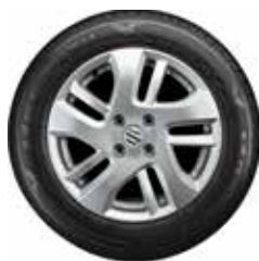
Optional 15" Alloy Wheels