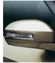
Clear Beige Metallic