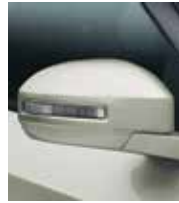
Artic White Pearl