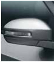
Silky Silver Metallic

With an array of eye-catching colours to choose from, it will be easy to find your perfect Swift DZire to match your personality and your life.