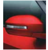
Bright Red Solid