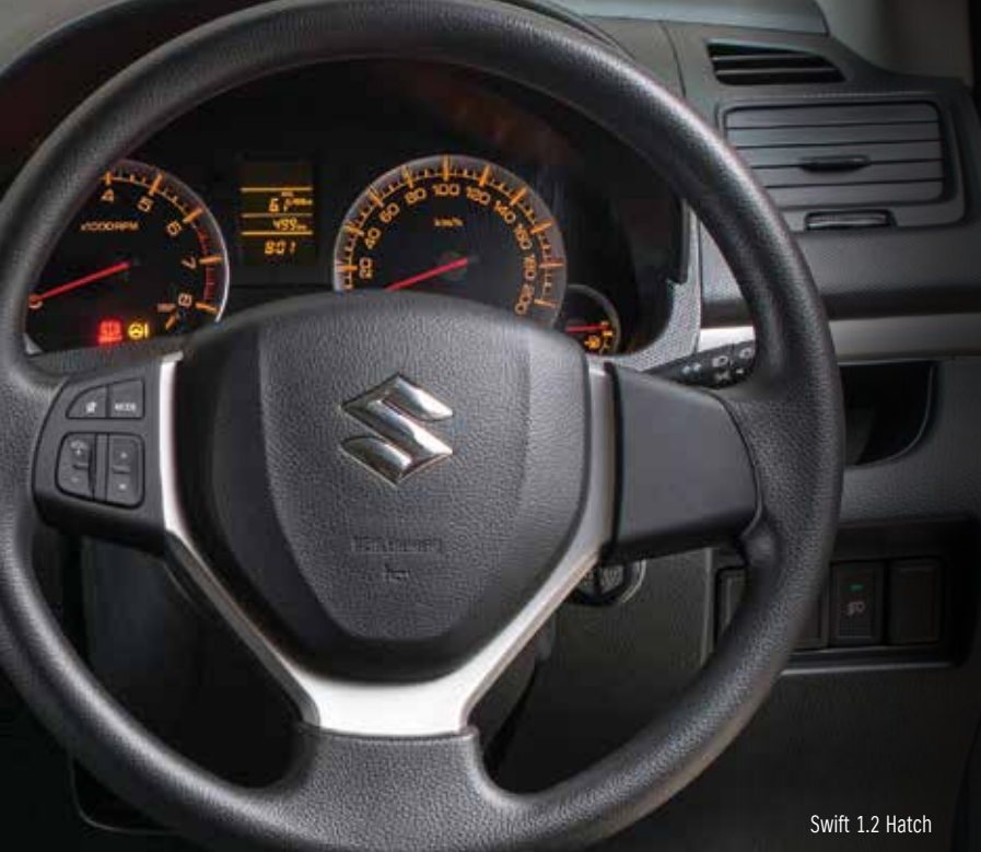
Swift 1.2 Hatch