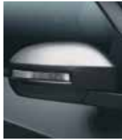
Midnight Black Pearl