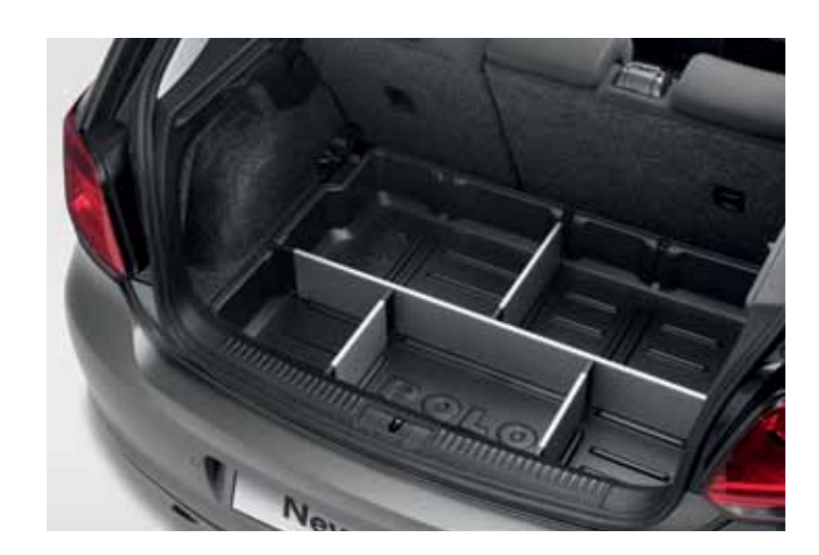
Volkswagen Genuine Luggage compartment loadliner with partitioning elements

The robust luggage compartment protection tray is equipped with three flexible partitioning elements that allow you to safely sort and store goods while driving. The plastic tray, with Polo lettering, fits the luggage compartment perfectly, has a 300 mm high rim to prevent liquids spilling onto the vehicle's floor, and is also washable, slip resistant and acid resistant.