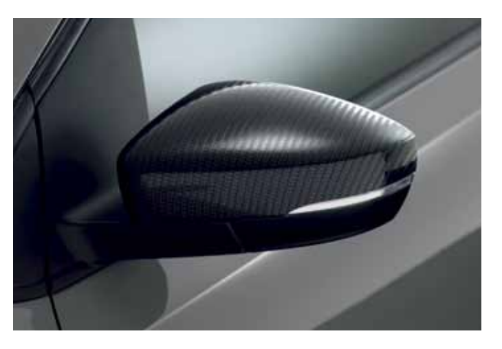
Volkswagen Genuine Mirror trim set

Part no. 6R4 064 365 Sunblind for the rear side windows, luggage compartment windows and for the rear window (set for 4 doors)