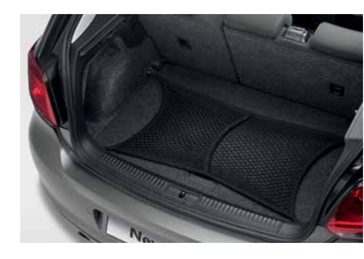
Volkswagen Genuine Luggage net