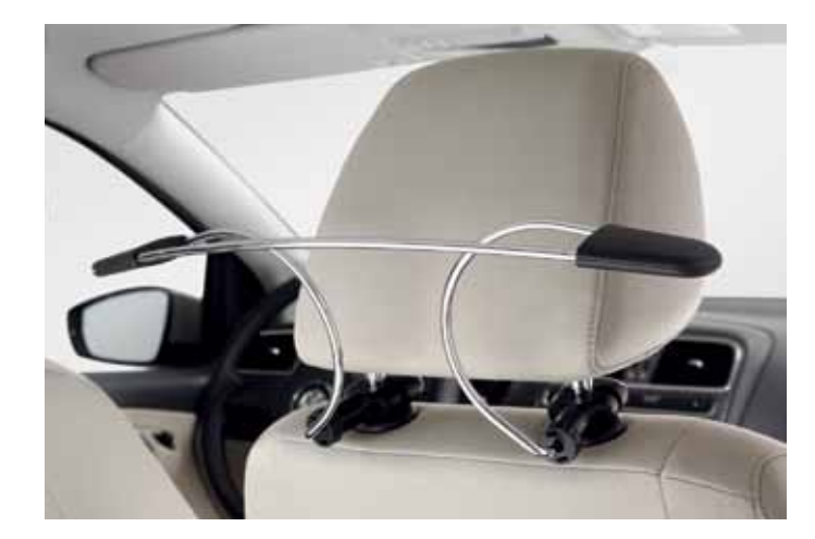
Volkswagen Genuine Clothes hanger Part no. 00V 061 127