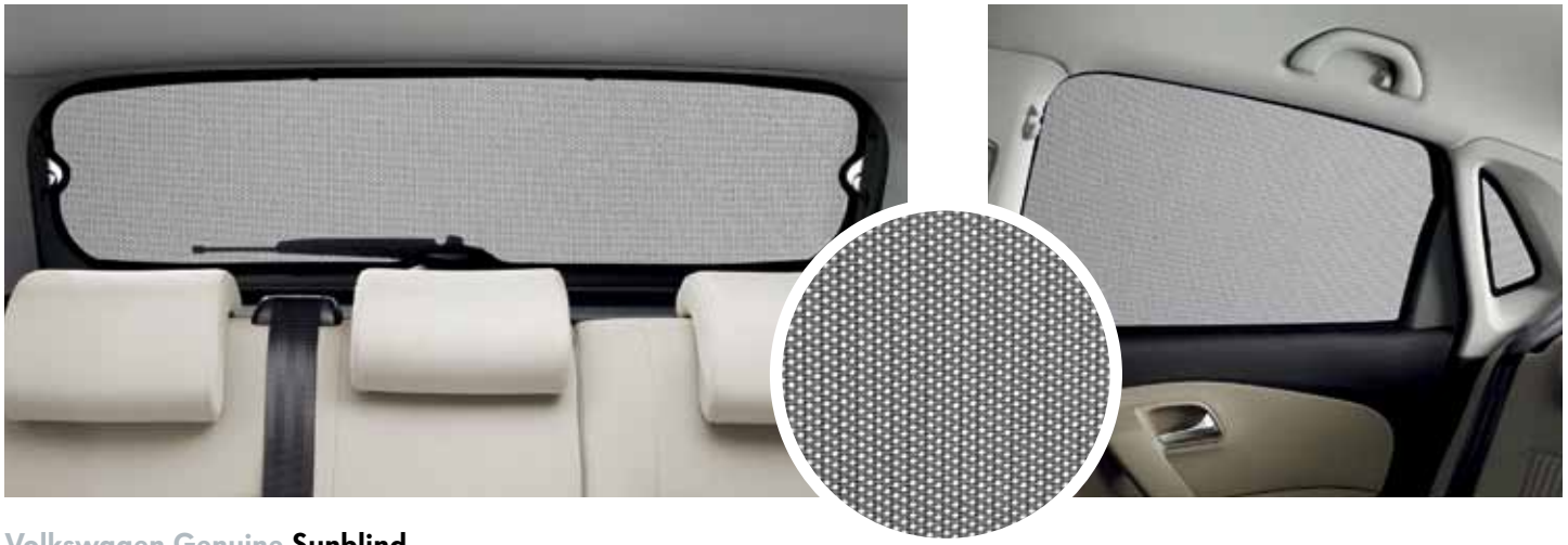
Volkswagen Genuine Sunblind

Part no. 6R3 064 365 Sunblind for the rear side windows and for the rear window (set for 2 doors)