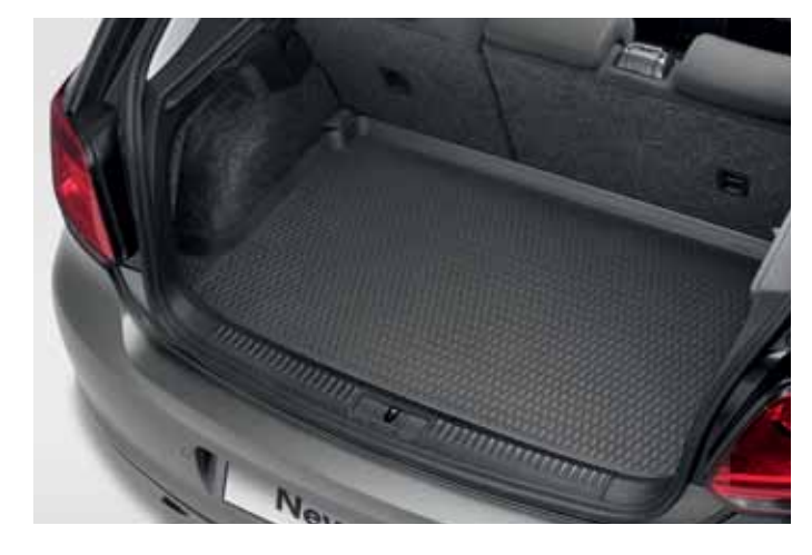
Volkswagen Genuine Luggage compartment inlay

Part no. 6R0 061 160 for Polo with basis load space Part no. 6R0 061 160 A for Polo with variable load surface