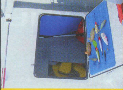
Bow storage hatch and lure panel