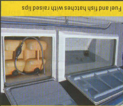
Fuel and fish hatches with raised lips

building of this boat. For more information on the V Cat or other boats in the range, Nathan Muntree can be contacted at Boat-A-Rama Durban (031) 305 3837 or 082 555 2807.